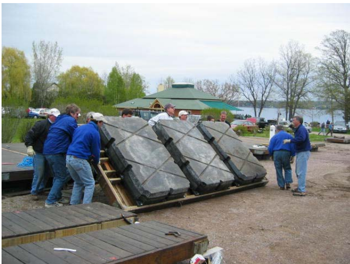
Dockwork in Progress—Spring Workday 2005