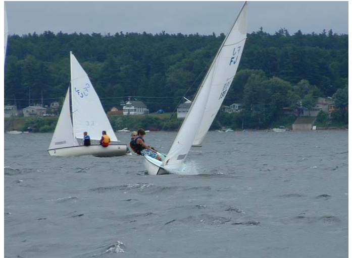
Trading Tacks at the Junior Sailing Regatta July 2005